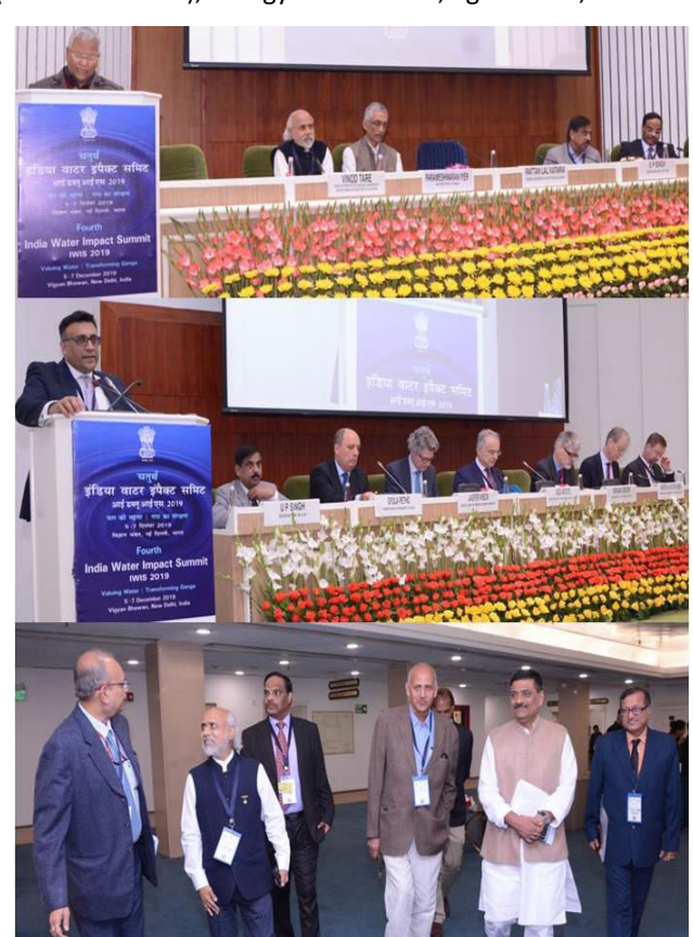
India Water Impact Summit 2019 – Glimpses

This year, the Summit will give an insight into the complexities and peculiarities of managing local rivers and water bodies with a larger vision of development that is synchronised with river conservation. The developmental approach in most significant sectors that are interwoven with river conservation measures, namely human settlements (urban and rural), energy and tourism, agriculture,